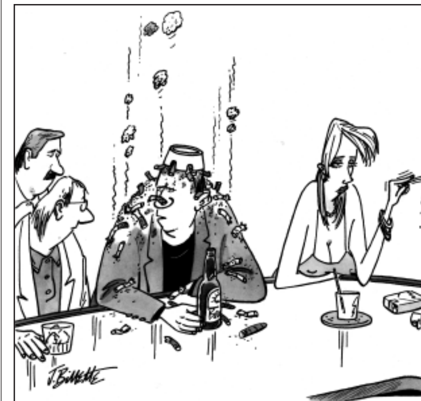
“Guys, the lady seems to have little interest in a clusterfuck. Plus, she says no to the blowjobs.”

Editor's Note: At press time, the Florida Elections Commission announced that it was declining to press charges against Coulter due to the expiration of a two-year statute of limitations. Critics called the decision “arbitrary” and said it showed the commission's unwillingness to enforce the law. 🌐