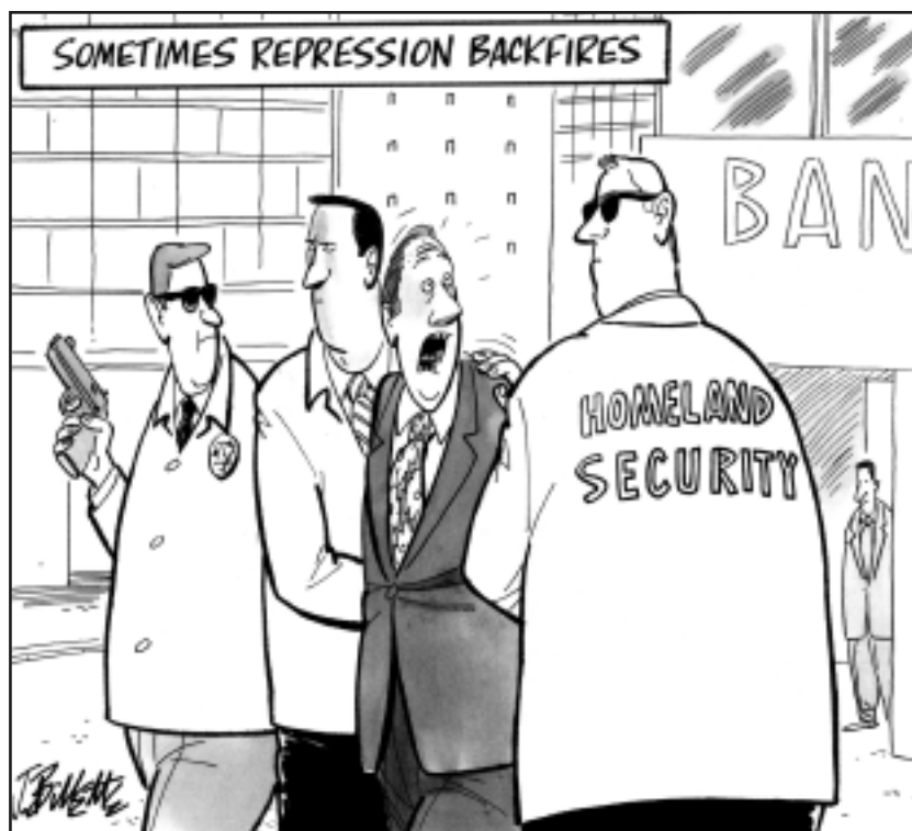
“This is a mistake! You must have the wrong guy! I'm a rich conservative! I voted for George Bush twice! I'm all for torture and spying on Americans! I think the war was a great idea! Hey, I love fascism!”